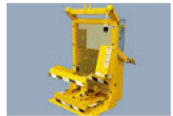
CUSTOM MOTORIZED LIFTERS