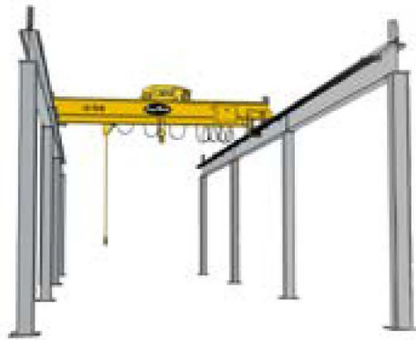
FREESTANDING RUNWAY SYSTEM