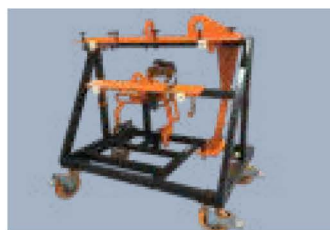
FIXTURE STORAGE CART