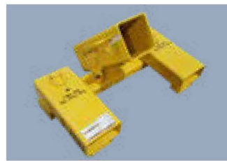
CUSTOM FORK ATTACHMENTS