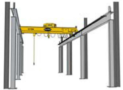
SEMI-FREESTANDING RUNWAY SYSTEM