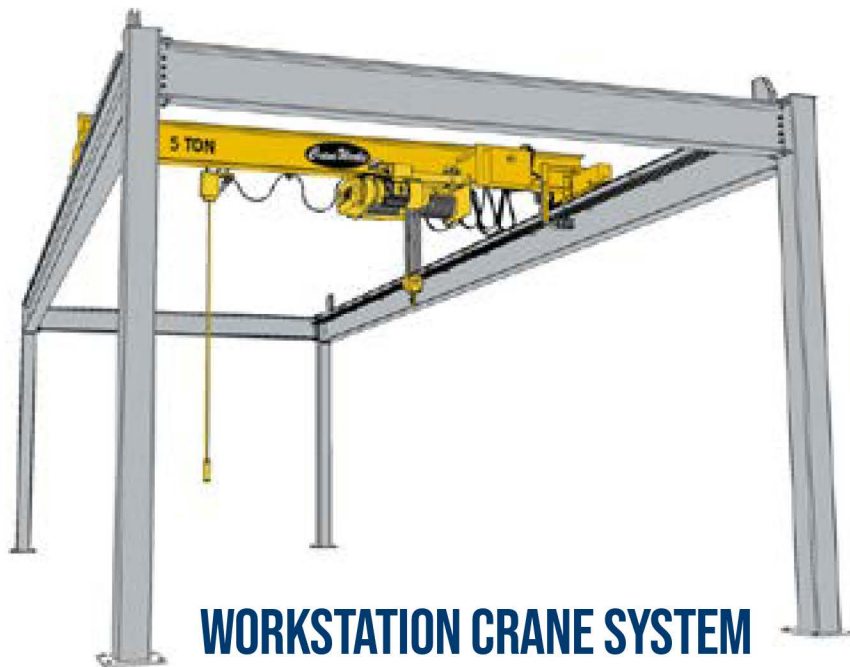
WORKSTATION CRANE SYSTEM