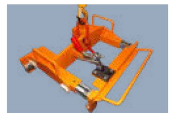
ENGINE BLOCK LIFTER