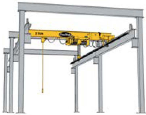
HEADER-BRACED RUNWAY SYSTEM