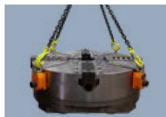
CUSTOM RIGGING EQUIPMENT